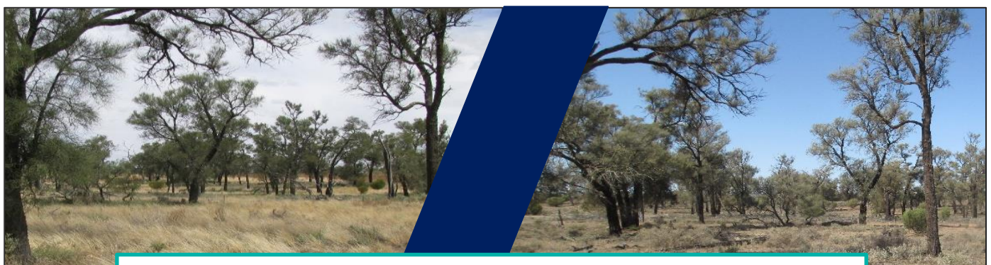
Vegetation change (grassy to shrubby understorey) between monitoring periods (M1 and M2).